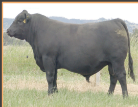
Bellaspur Just Do It S6 Sold to World Wide Sires

Freeze Branding Artificial Insemination Preg-Testing Covering NSW & VIC