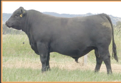
Bellaspur Just Do It S6 Sold to World Wide Sires

Freeze Branding Artificial Insemination Preg-Testing Covering NSW & VIC