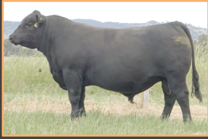
Bellaspur Just Do It S6 Sold to World Wide Sires

Freeze Branding Artificial Insemination Preg-Testing Covering NSW & VIC