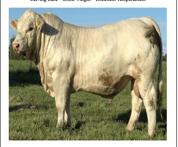
Clarinda Downtown Q32 Semen Available Outstanding Calves.

Bulls & Females for Sale ***Bulls Guaranteed*** Calving Ease * Extra Weight * Excellent Temperament