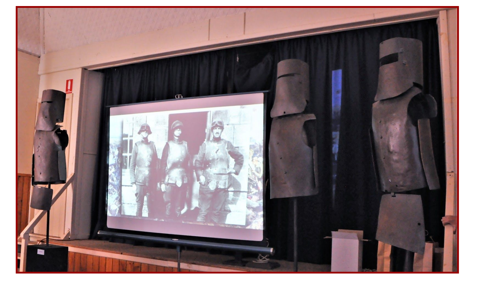
Displays of Kelly gang replica armour on loan from The Ned Kelly Vault, Beechworth