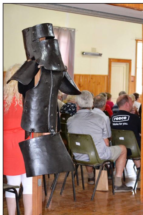
Replica of Ned's Armour

We would love more local human interest stories. Please forward them, with the permission of the subject, to gretabunyip@gmail.com