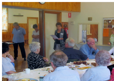
An enjoyable Afternoon Tea