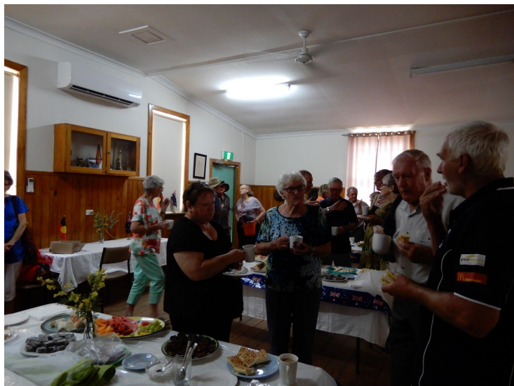
Locals enjoying morning tea in air conditioned comfort.